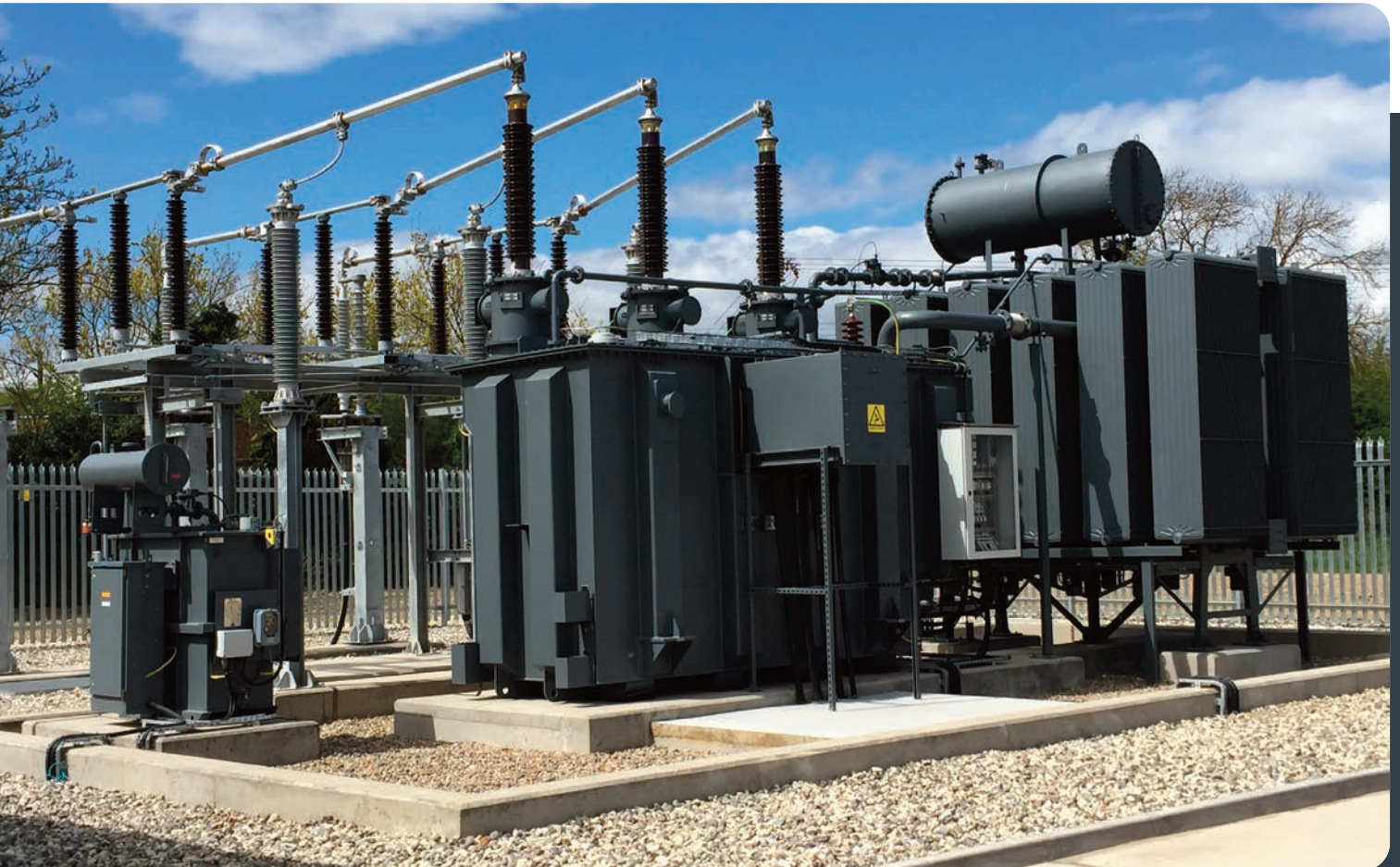
50MVA Wilson Power Transformer at Melbourne Grid

We design, manufacture and supply a wide range of custom power transformers with ratings from 5MVA to 300MVA with voltages from 3.3kV up to 400kV (non-standard voltages available upon request). Our Power Transformers are built to comply with EU Ecodesign regulations and usually follow the vector group options Dyn11, Dyn1 (Up to 132kV) YNd11, YNd1, with customisable two or three windings.