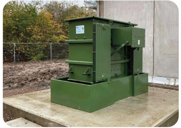
1MVA Auxiliary Transformer at Erskine

Our auxiliary transformers are designed bespoke to your needs and installed where necessary as part of your power transformer assembly.